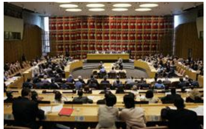
Figure 1.1 Inaugural Session of Peacebuilding Commission Opens.

The Peacebuilding Fund was created under the petition of the Secretary General in order to ease the Peacebuilding initiatives 3 . It works as a global fund with the aim of aiding countries in need of