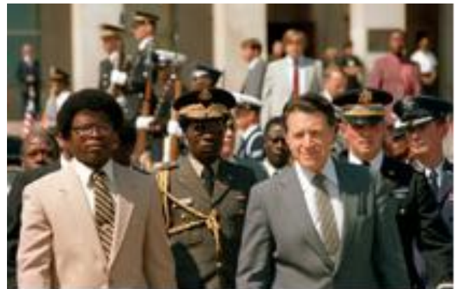
Figure 1.4 Secretary of Defense Caspar W. Weinberger and Samuel K. Doe.

After the death of Doe, ECOWAS instituted an interim government in Gambia, and it was led by Dr. Amos C. Sawyer. Even though the intention was to create a government that could lead to democracy, Taylor's forces refused to accept this government and more confrontation occurred, this led to the first civil war in Liberia. Many peace accords were reached, but none of them were honored, and confrontation worsened and Taylor's factions continue to separate and create new guerrillas. 18