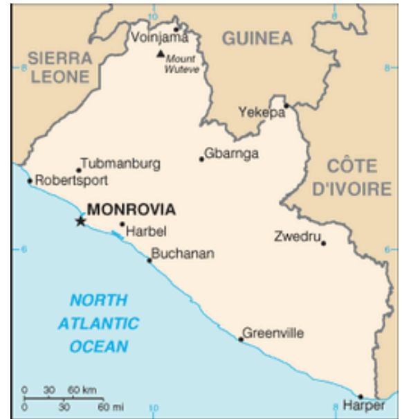
Figure 1.2 Geographic map of Liberia showing frontiers. Cia.gov.

lands 9 . No other contact between the European settlements was known until 1821 when a group on freed slaves and mulattoes emigrated from the United States to the west coast of Africa and established the Republic of Liberia 10 .