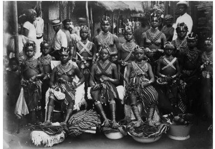
Figure 1.3 Liberian women from the Mano tribe in 1910.

with 51% of approval but the continuous threats of coup d'états led his government to be each time more repressive and corrupt, bringing down newspapers and banning political participation. 14