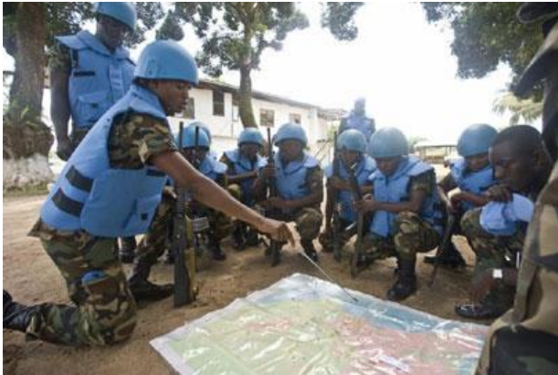
Figure 1.6 UNMIL after patrolling the city of Buchanan (2009).

On 18 August, at the peace talks in Accra, Ghana, the parties signed an agreement. The agreement declared an immediate end to the war and provided for the establishment of a National Transitional Government of Liberia that would take over from the interim government headed by President Blah by 14 October 2003. Under the peace agreement, the parties had to immediately disengage and comply with the ceasefire agreement. ECOWAS was called upon to establish a multinational force that would secure the ceasefire, assist the transitional government in the implementation of the agreement, create a zone of separation between the belligerent forces and provide a safe corridor for the delivery of humanitarian assistance 28 . The parties to the agreement also committed themselves to ensuring