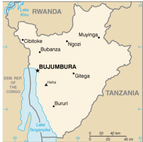
Figure 1.13 Geographic map of Burundi showing frontiers. Cia.gov

Besides Liberia and Sierra Leone, it is well known that many African nations have been hit national conflict and civil war in the last century.