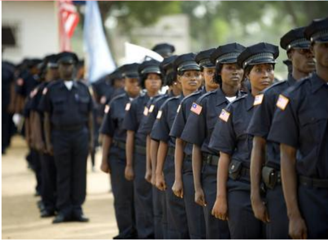
Figure 1.9 Liberia National Police Graduation Ceremony in Monrovia (2009).

Another important issue on this matter is the Armed Forces of Liberia. It is expected to be fully operating by 2012, however it is not sure if the Government of Liberia will be able to maintain an Army financially for much longer; and also its role under the Constitution is still to be defined 46 . Regarding the population's acceptance since throughout Liberia's history, a lot of militaries have been politicized and this might bring resistance to this idea as well as conflicts between parties.