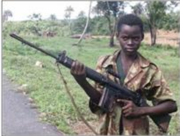
Figure 1.11 Child soldier from Sierra Leone.

First all there was an important change in the approach of governance, with a reduction in the corruption level within the government, which can be evidenced with the rise of Transparency International Index 63 . Either way, the country still has high levels of corruption but new measures are being taken into action by the national government.