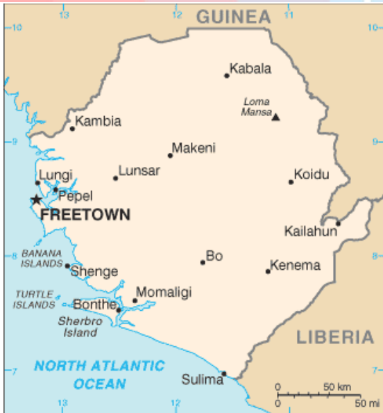
Figure 1.10 Geographic map of Sierra Leone showing frontiers.

The civil war in Sierra Leone was one of the most notorious in the African continent, due to its devastating nature and well-known fights over the control of their famous production of diamonds. Since 1998 the United Nations started to have a presence in the conflicted nation, with an observer mission, later a peacekeeping mission was sent to the country, then the mandate switch from peacekeeping to peacebuilding in 2005 59 , at the same time the United Nations Security Council requested the PBC advice on the situation of Sierra Leone and was one of the first countries ever to be considered by the Commission 60 .