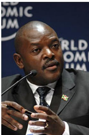
Figure 1.14 Current President of Burundi, Pierre Nkuruziza

nevertheless overall criminality across the country started to increase, specially armed attacks, residential attacks, ambushes and sexual violence; the issues were attributed to several factors such as the prevalence of small arms and light weapons, conflicts over land, and the limited socio-economic reintegration opportunities for demobilized soldiers and ex-combatants, returning refugees, the displaced and other vulnerable groups.