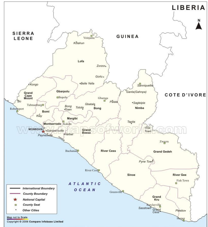
Figure 1.8 Map of the counties of Liberia.

The Commission provides both financial and technical assistance to resolve land issues. One example was the resolution of one of the ten contentious county border disputes, which was between Sinoe and Rivercess Counties 40 . This is one of the few problems the Commission was able to solve in relatively short time.