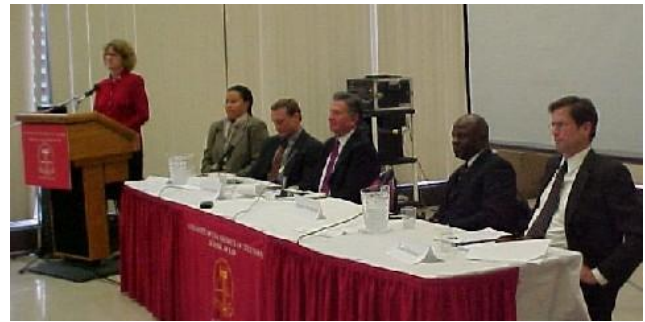
Figure 1.7 Signing of the peace agreement in Accra (2003).

the presence of security guarantees for the safe return and resettlement of refugees and internally displaced persons. By the Agreement, the parties also requested the United Nations to deploy a force to Liberia under Chapter VII of the Charter of the United Nations to support the National Transitional Government and assist in the implementation of the Peace Agreement 29 .